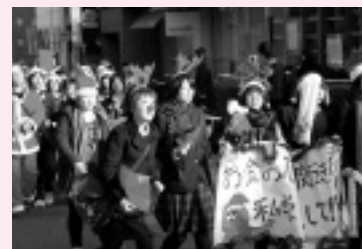
Parade by high school students

Now in Japan, high school students influence public opinions and the society steadily.