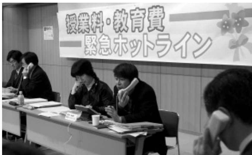
The telephone counseling of educational expenses was received.

Reflecting our movements, the new administration published some important measures and budgets, though with various challenges.